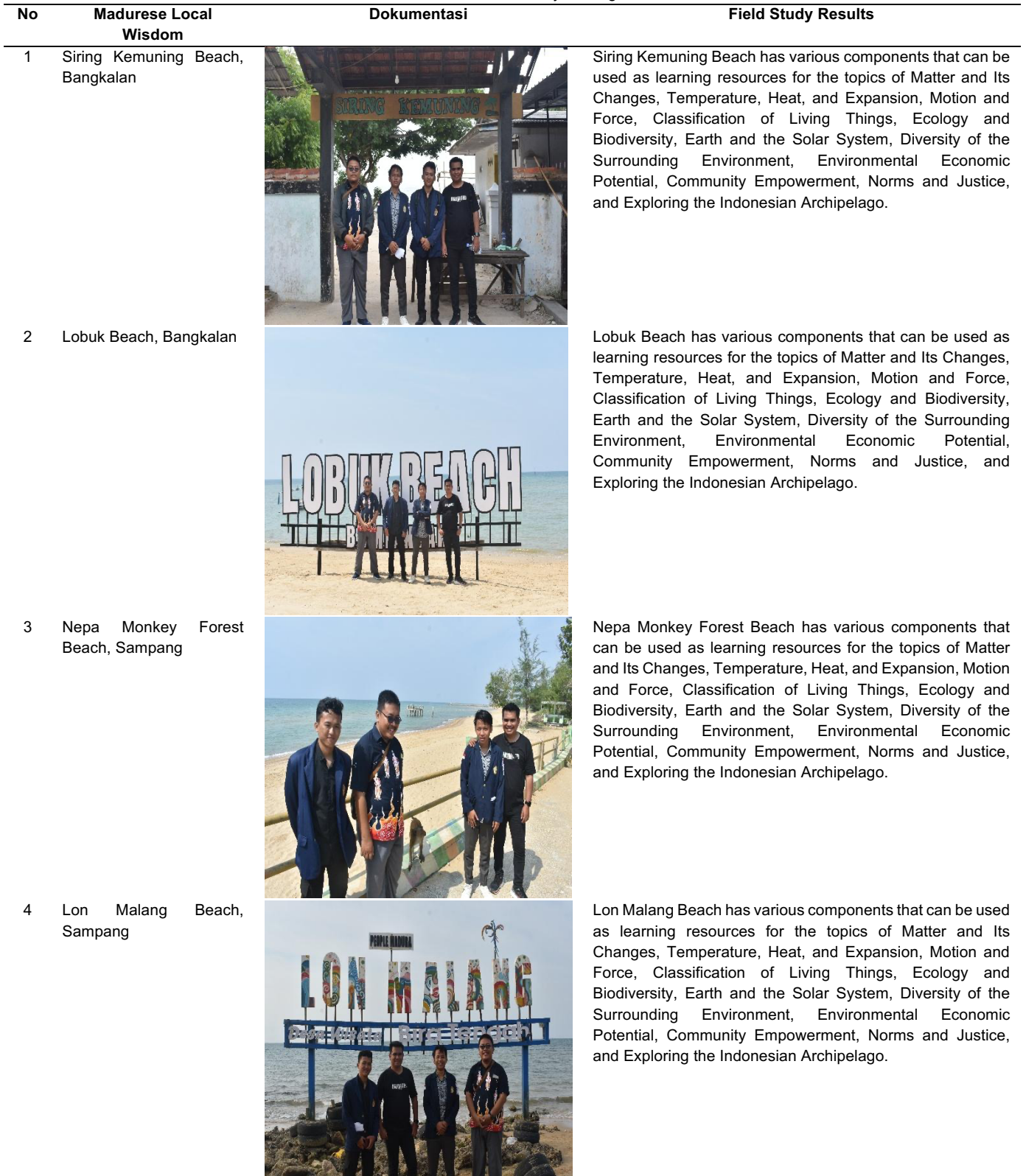
TABLE 2 / Field Study Findings